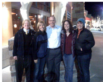
Interest Group Members

There are significant environmental issues impacting the western states and WSCA provides an important venue for dialogue and meaningful connections relevant to creating interconnected environmental ethics. As such, we wanted to articulate the nature and scope of environmental communication so members of WSCA can better understand who we are as a group.